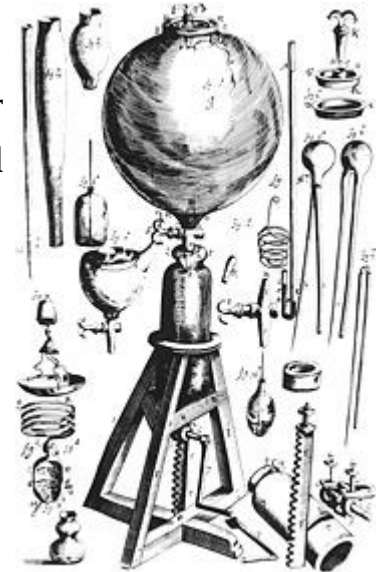
Illustration of an air pump used by Robert Boyle for gas pressure experiments in the 1600s.

We live in a particularly crowded region of space with a lot of solid material around us. In reality, the vast majority of matter in the universe is in a gaseous state. So, in order to understand how the universe works, we have to understand how gases behave. In this lab, we will explore the relationship between the temperature of a gas and the pressure that it exerts. We will also calculate the lowest possible temperature and understand why nothing can be colder.