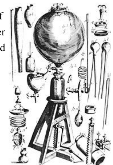
Illustration of an air pump used by Robert Boyle for gas pressure experiments in the 1600s.

All matter is composed of atoms and molecules. In a solid, they are locked together and are unable to move freely about. In a gas, however, they are not bound to one another and zip around bashing into things. When you blow on your hand, the